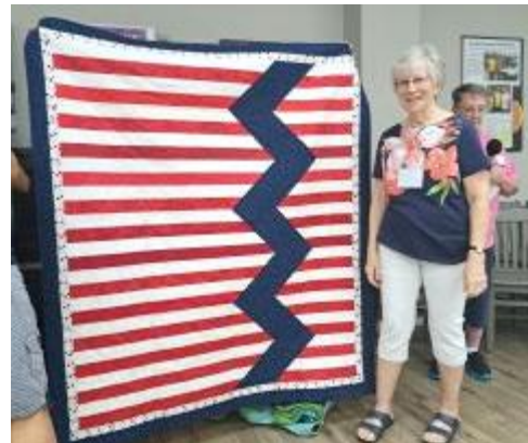
Red/White/Blue by Kathleen East. Great Patriotic Quilt. Great Job!