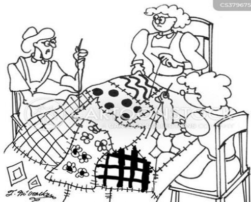
"All right, who sewed in the disposable diaper?"