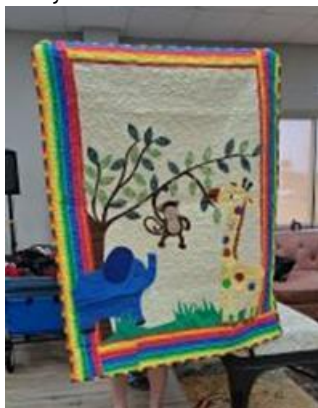
Cute Child’s Quilt, but unfortunately could not figure out who was behind it. No listing for it on the sign-up sheet that I could tell.

Note from Editor: Due to amount of pictures and space in the Newsletter, I am not always able to put all the show & tell pictures in, but be assured I have saved all of your pictures and they could appear in another newsletter down the road.