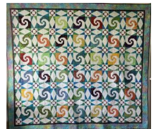
Snails At Sea (86 “ x 96”)