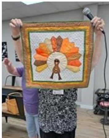
Two Great Wall Hangings for the Boutique by Penny Dyer.