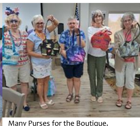
Many Purses for the Boutique. Great job ladies.