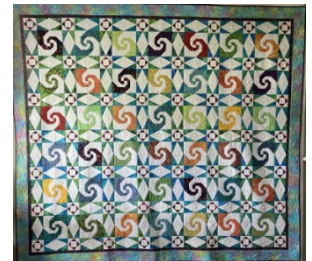
Snails At Sea (86 “ x 96”)