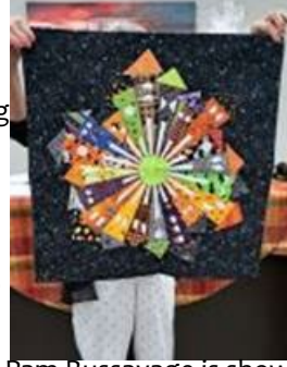
Pam Russavage is showing her “Dresden Neighborhood quilt. Amazing!