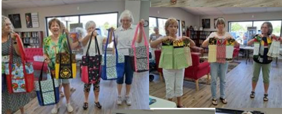
Several items are being shown that the ladies have made for the Boutique. Mesh Bags, Christmas Tree wall hangings, Hanging Towels and Reading Pillows to name a few.