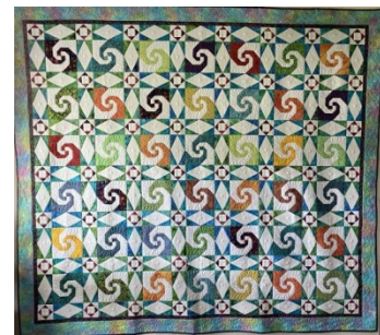
Snails At Sea (86 “ x 96”)