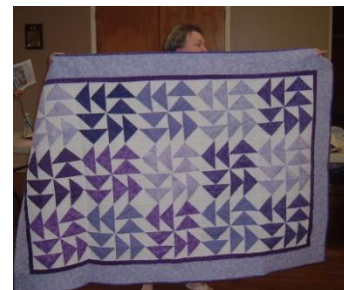
Rowena Cox has been busy making this flying geese quilt. Great shades of lavender.