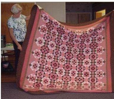
Bonnie Staveski – Peppermint Patty A beautiful combination of pinks and browns. Great job Bonnie.