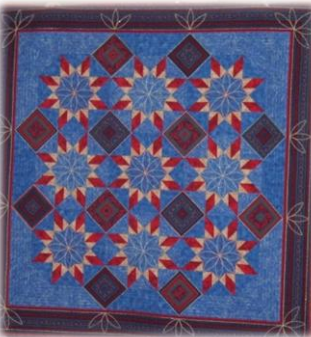
Asterisks – This quilt received a 2 nd place Red Ribbon and a Cash Award at the prestigious American Quilters Society Show in Nashville, TN in 2004.

Below are just a few of her quilts showing some the couching and finishing techniques.