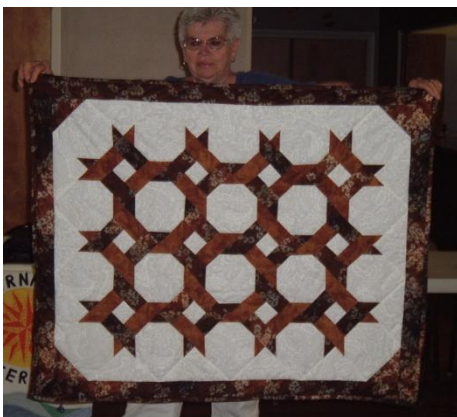
Sonja Kleist is showing a beautiful rust, white and brown quilted wall-hanging. A really nice design. Good job Sonja.