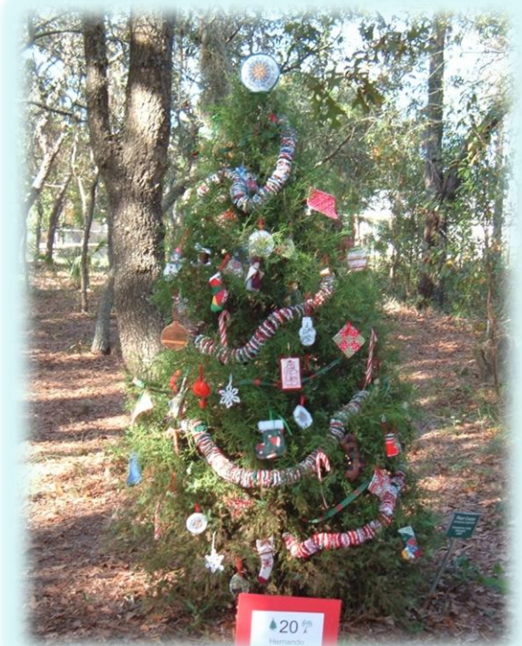
Christmas In The Gardens