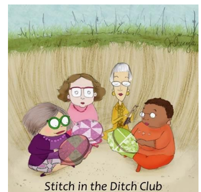
Stitch in the Ditch Club