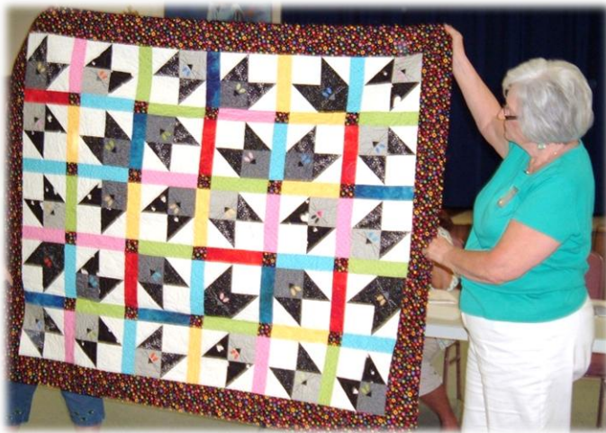
Carol Aldridge is showing a very colorful quilt with cat faces all around! Cute! Most quilters are cat lovers and we do them proud!