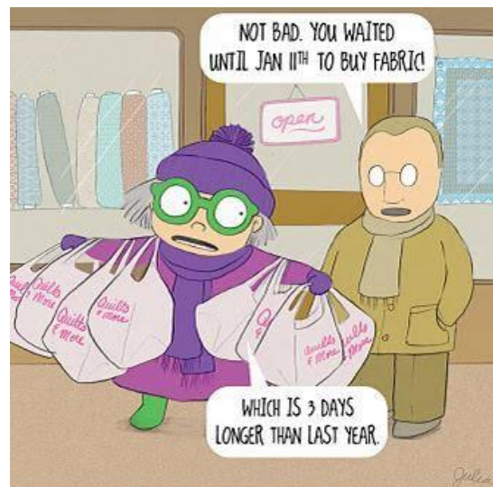
Another New Year's Resolution bites the dust.