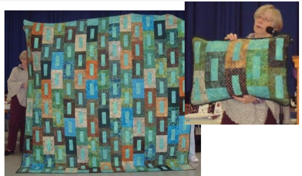
Kathleen East made this beautiful bed quilt and pillow shams. Beautiful colors and nice job Kathleen.