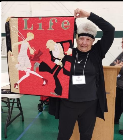
"Teaching Old Dogs New Tricks"