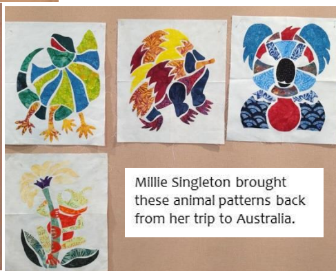
Millie Singleton brought these animal patterns back from her trip to Australia.