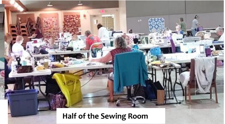
Half of the Sewing Room