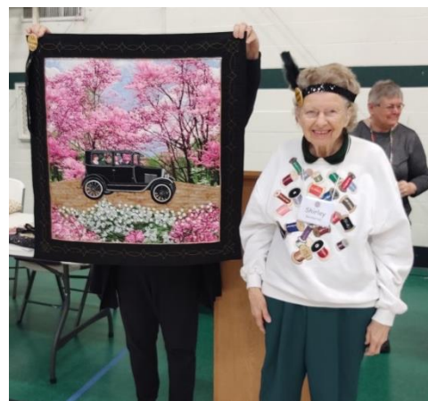
"A Ride In The Country"