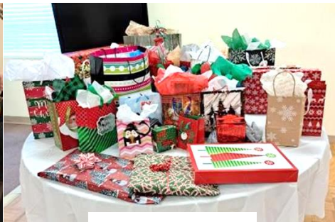
The Gift Table!