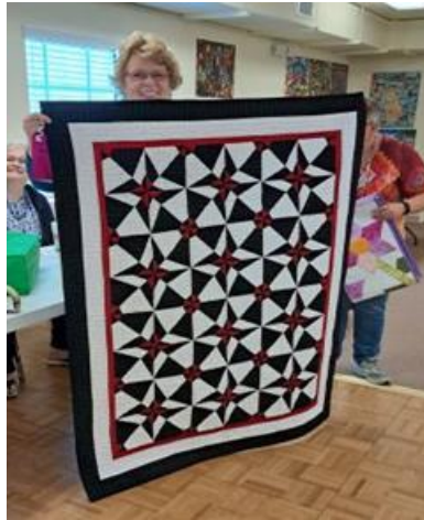
“Day & Night”