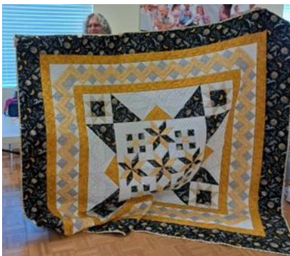
Louise Isabelle displays her latest star quilt. As usual, just awesome!