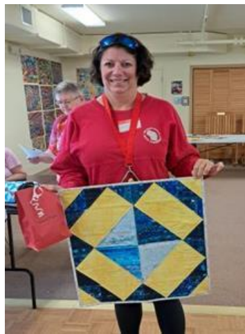
“Triangle Table Topper”